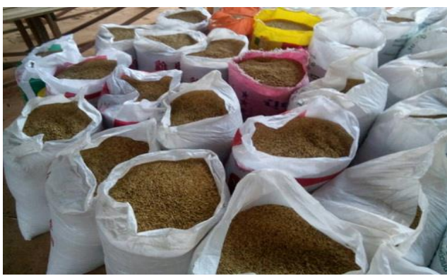
Rice for the children at orphanage

The rice harvest this year is not very good for some unknown reason, all the rice farmers in this area are suffering from a bad harvest. every year we normally harvest around 358 bushels of rice, which is sufficient for one year. But this year we only managed to harvest 179 bushels of rice which will not be enough for this entire year. We need to find an additional 148 bushels of rice in order to have enough for the children this year. Please pray for this situation and that we will have enough funds to buy the rice for the children, the total cost for buying additional rice for the children will be $1,328.