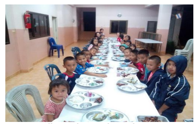
dinner time at the orphanage

This year at the orphange we have 29 children in total. 2 are in Kindergarten, 15 in elementry, 3 in junior high, and 5 in high school and finally 4 are in Bible college and universities.