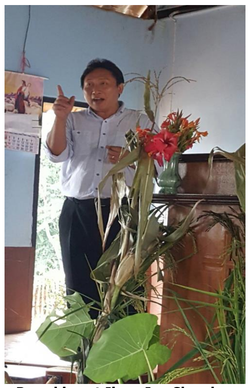
Preaching at Jiang Jan Church

Since coming back from the States I have been going around as usual and visiting and preaching at the churches and completing the projects.