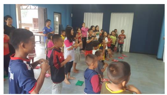
English lesson activities

In the last monsoon season after we came back from the U.S., around the area of the orphanage there was an out break of Dengue fever and there were reports that many people in Mae Gone village and the surrounding area contracted Dengue fever from the large number of mosquitos. Though this was the situation in the orphanage area, we truely thank God that none of our children at the orphanage got Dengue fever.