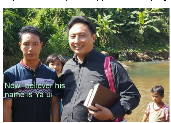
new believer at Jiang Jan village

I am pleased to report that with God's grace we have finally finished building the new church at Jia Jan village without any complications. The total budget for this project is $13,857. We thank you for your prayers and for your support of this project.