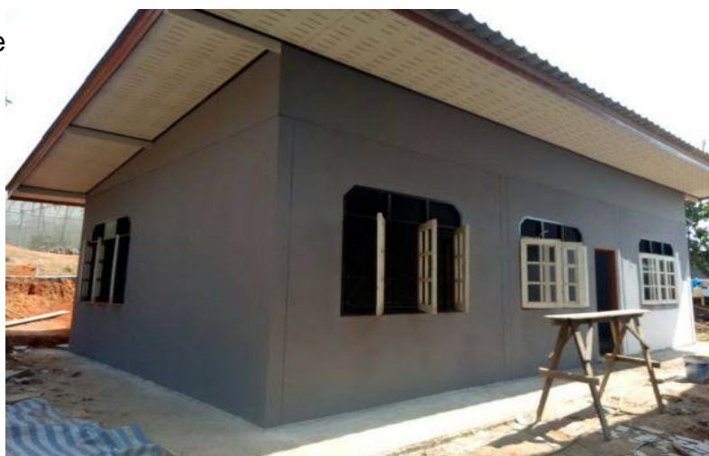
House parent's residence

Also in this year we will have 4 new children coming to the orphanage 2 boys and 2 girls. We will give you the details of these new children when they come to the orphanage and whoever is interested in sponsoring any one of them please let us know.