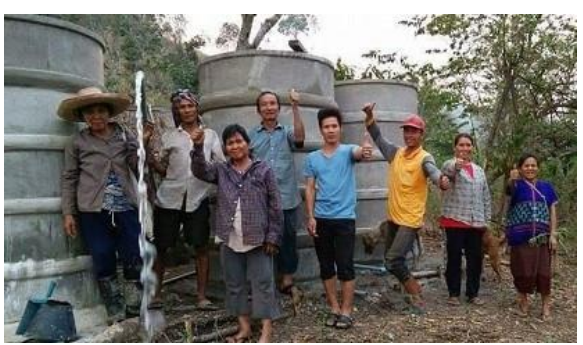
Successful water project