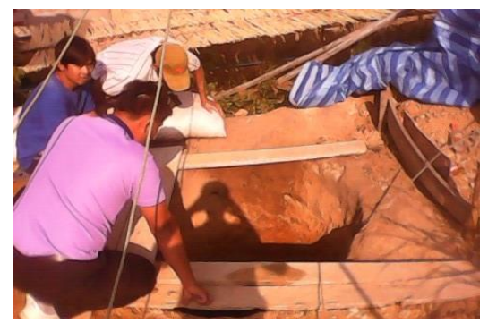
Digging new well

In the last 5 months there was a severe drought in Thailand. This drought has heavily affected the villagers of the Pang Kwai and Shan area where we are ministering resulting in a severe shortage of water, one of the worst that has ever occurred in this area. We praise God and thank you for prayers and support that you have provided for the villagers. With your help the villagers were able to find new sources of water and now the water shortage problem has been solved.