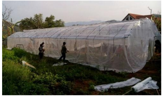
Green house for the orphanage

We also that God that Surachai is now back at the orphanage doing his internship. We are glad that he is back and helping to teach the children many things and setting a good example for the younger ones to follow. Please continue to pray for these children that they will continue to grow and remain in good health.