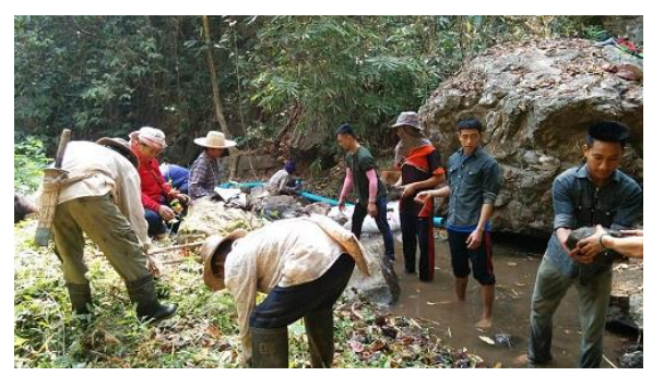
Piping water to the villege