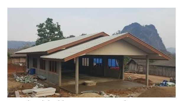
New church building at Jiang Jan under construction