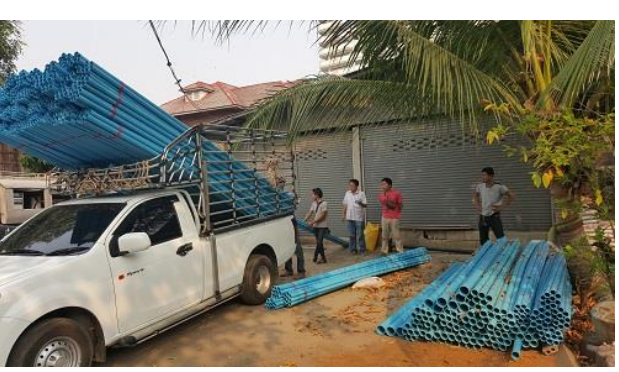
Pipes for water project