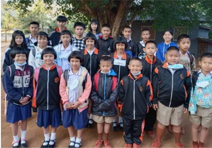
Some of the orphanage children