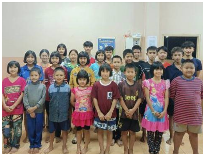
The orphanage children