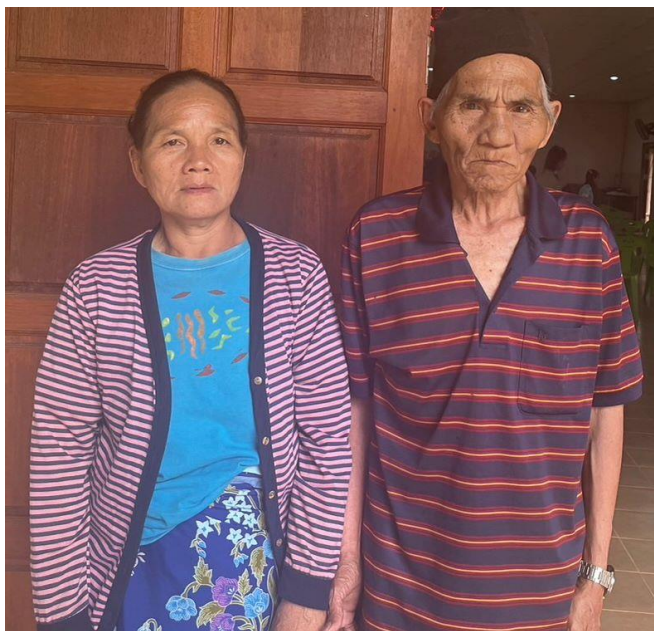
father and his daughter

We began our ministry in this village in 1996. We praise God that about 1 year later in 1997 a majority of the villagers of this village accepted Christ as their Lord and Savior and were baptized. Since then more and more people and families living in this village have accepted Christ.