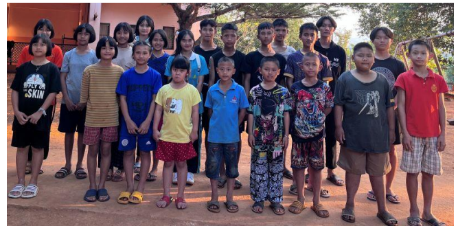
The children of the orphanage