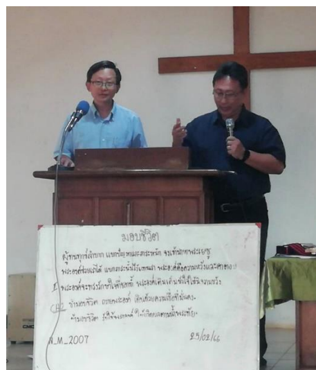
Teaching at Bible conference