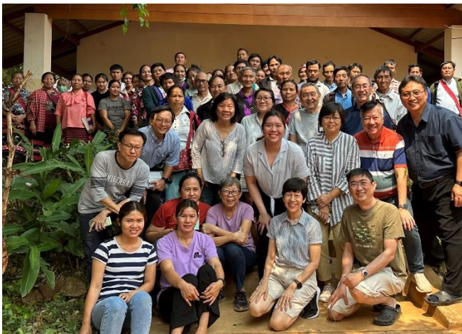
Group photo of those who attended this Bible Conference and Medical Ministry