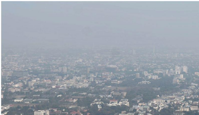
Chiang Mai city filled with smog

"So shall my word be that goeth forth out of my mouth: it shall not return unto me void, but it shall accomplish that which I please, and it shall prosper in the thing whereto I sent it." Isaiah 55:11 ASV