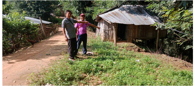
Land for building the Church

keep this village in your prayers that there will be enough funding to build a church here for the believers. As for the labor cost of this project, the other churches that we minister in will help raise funds for the labor cost of building this church.