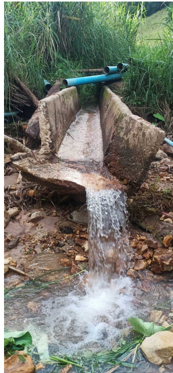
Collapsed irrigation canal

for your prayers and help with raising the budget to repair the irrigation canal.