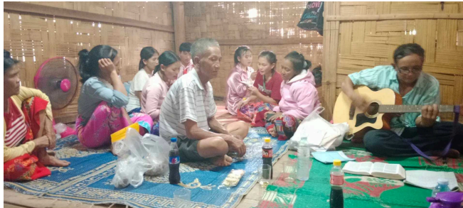
Worship in the evangelist's home

The 9 churches that we are ministering are all doing well. There is however, one village where we are preaching the Gospel where we have four families of converts. One of the family's wives has been suffering from heart disease. By the grace of God, she has been able to live for many years after she found out that she has heart disease but sadly last night she suddenly passed away. Please keep this family of new believers in your prayers that now there is the husband and their sons and daughters. Please pray that they will find comfort in God's promise and that they will continue to grow in their faith in Christ.