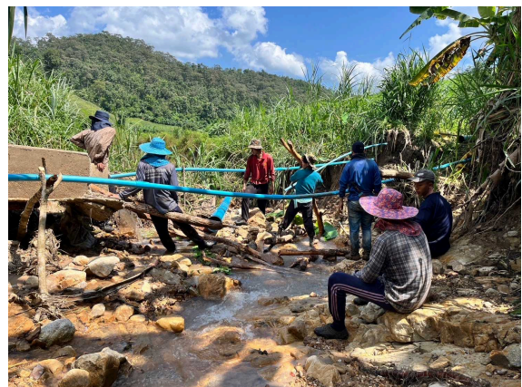
Repairs of the irrigation canal

We have temporarily repaired the irrigation canal as a necessity because at this time the rice plants are producing ears and the rice plants are badly in need of water during this stage of their growth.