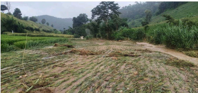
the orphanage's damaged rice field

We praise God that all the children in the orphanage are doing well, with nothing more than a slight cold. Last week the children just finished their first semester exams. The school is currently on a school break for 1 month. Their schools will resume again on November 1, 2024. This year, due to the heavy rains as stated, the rice fields around the orphanage was hit by flash floods.