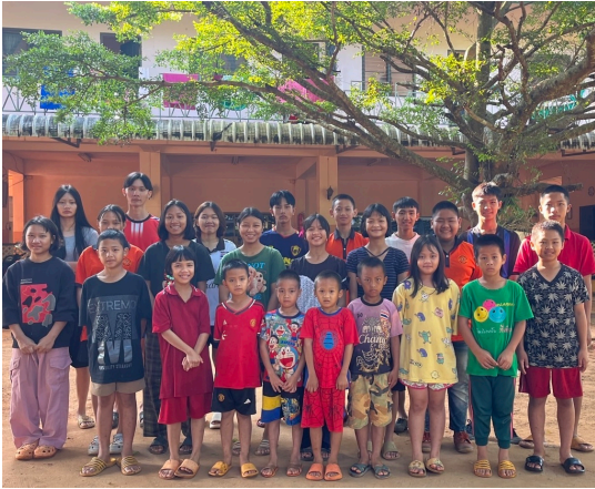
The children at the orphanage

We praise God that all the children in the orphanage are doing well, with nothing more than a slight cold. Last week the children just finished their first semester exams. The school is currently on a school break for 1 month. Their schools will resume again on November 1, 2024. This year, due to the heavy rains as stated, the rice fields around the orphanage was hit by flash floods.